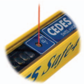
ILAS, laser alignment system