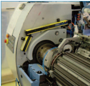
A 125° Safe4 L-configuration in a weaving machine