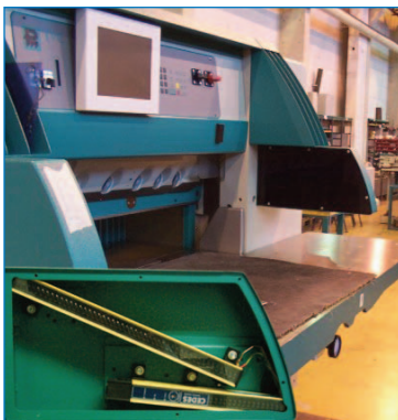
Special solution for a guillotine machine