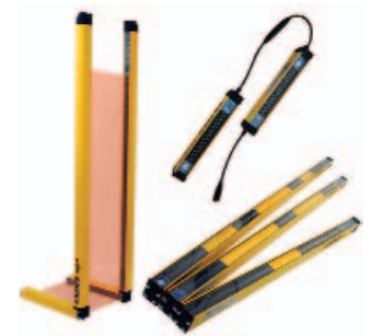
L-Configuration, Cascading and Perimeter systems