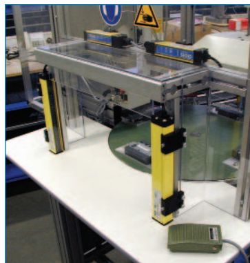
Safeguarding a stamping machine