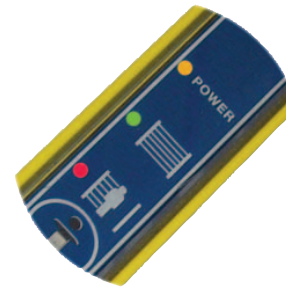
LED status display