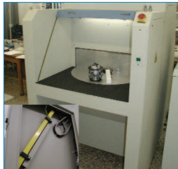
Design-in for a laser welding machine